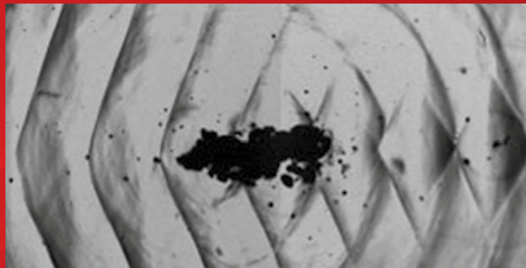
Shockwave formation in gel