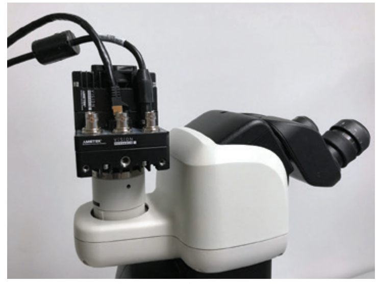
Miro C110 (connector view) mounted on a microscope