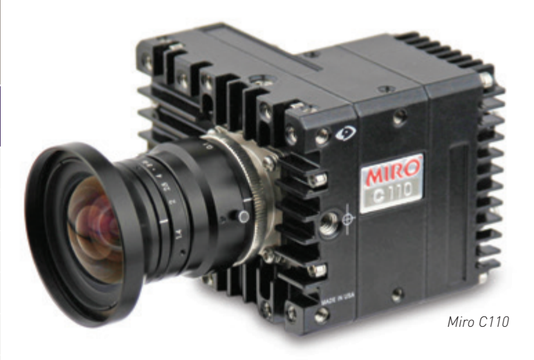
Miro C110 mounted to microscope