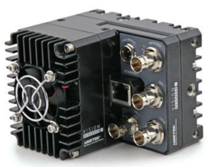
Miro C110 Connectors